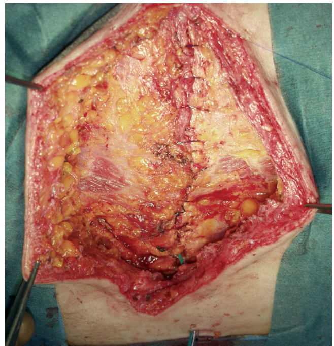
Figure 3 The figure presents the complete closure of the wound after NPWT therapy and pectoralis plasty.