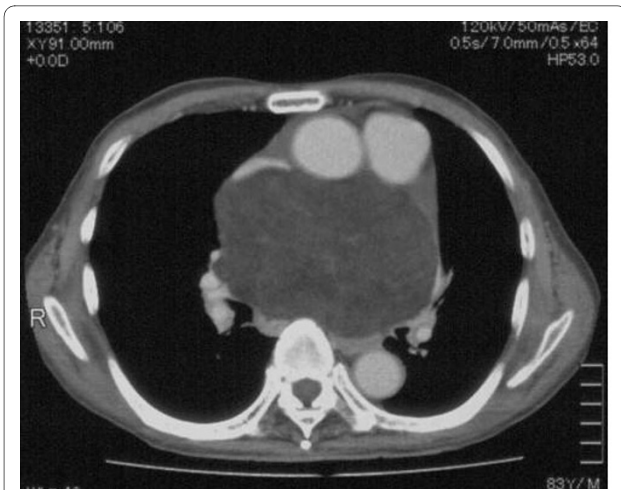
Figure 1 Computed tomography showed a large tumor behind the ascending aorta and pulmonary artery and compressing the right and left atria.

ing blood from the superior and inferior vena cava, ascending aorta and main pulmonary artery were cut. The tumor was encapsulated with a thin membrane and showed no invasion into surrounding tissues. A tight adhesion was observed in an extra-pericardial mediastinal fat tissue in the superior-posterior portion of the bifurcation of the right pulmonary artery. Except this portion, the tumor was relatively easily detached from surrounding tissues. A solid tumor encapsulated with a thin membrane was completely removed as a mass (Fig 2A). The tumor weighed 500 g (Fig 2B). The cut superior vena cava, ascending aorta and main pulmonary artery were reanastomosed. Extracorporeal circulation was discontinued without difficulty.