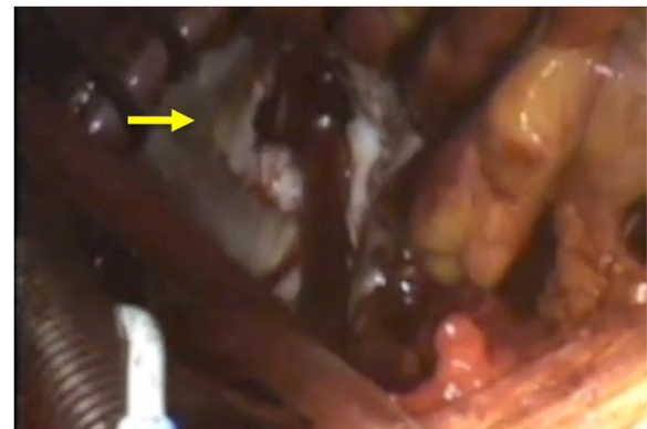
Figure 2 Intraoperative view of the mitral valve (arrow).

and suture technique was performed. A 26-mm Cosgrove-Edwards band (Edwards Lifesciences) was secured onto the posterior annulus for annuloplasty. The valve was verified competent under physiologic condition and a saline injection test was not necessary. The left atrium was closed using a standard technique. The tricuspid annuloplasty