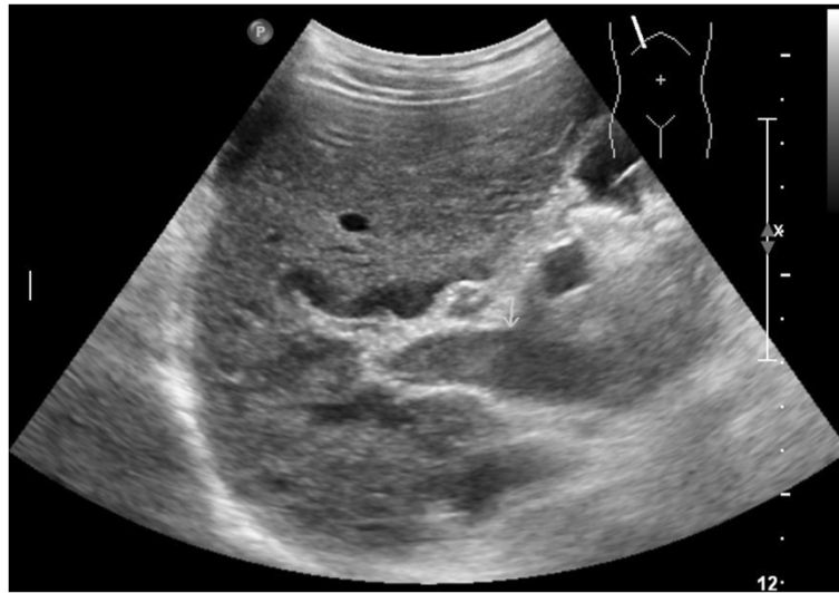
Figure 1 Abdominal ultrasound revealed thrombosis in proximal portion of the portal vein.

text confirmed ATIII deficiency in this patient with only 30% of normal reference value, this level still maintained 3 month after the surgery. Conservative treatment strategy was chosen for this patient including increased intensity of anti-coagulation (combining lower molecular heparin as well as oral warfarin) as well as endoscopic variceal ligation. Patient's symptom gradually improved and repeated contrast enhanced CT scanning showed the formation of portal venous collateral circulation. This patient then underwent open abdominal thrombectomy 1 month after the cardiac procedure and recover well.